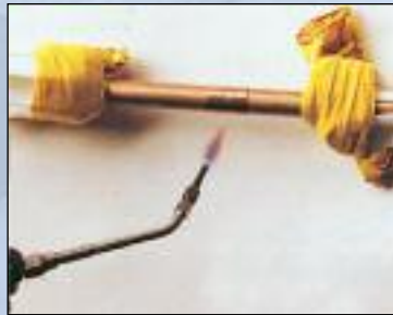
Be sure not to aim the blowtorch directly at the plastic