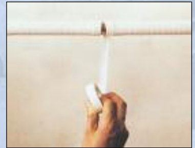
When the joint is complete and cool, fold back the plastic coat and wrap the joint to give continuity of protection.

The graph below indicates the lower surface temperatures of Protec 2000 measured against bare copper in air