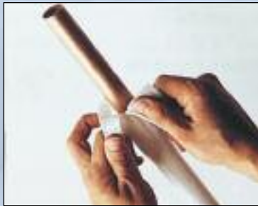
Fold back to reveal copper.

Internal springs are available for tube up to this size but tight radii bends are not advised.